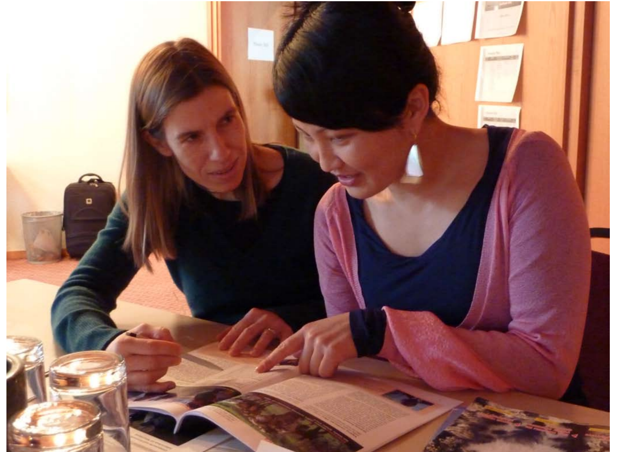
An editor advises an author on how to develop her policy brief

Download training materials from www.mamud.com/techniques.htm