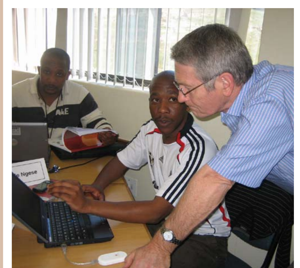
The one-on-one clinics let the participants learn while writing on their own speciality area.