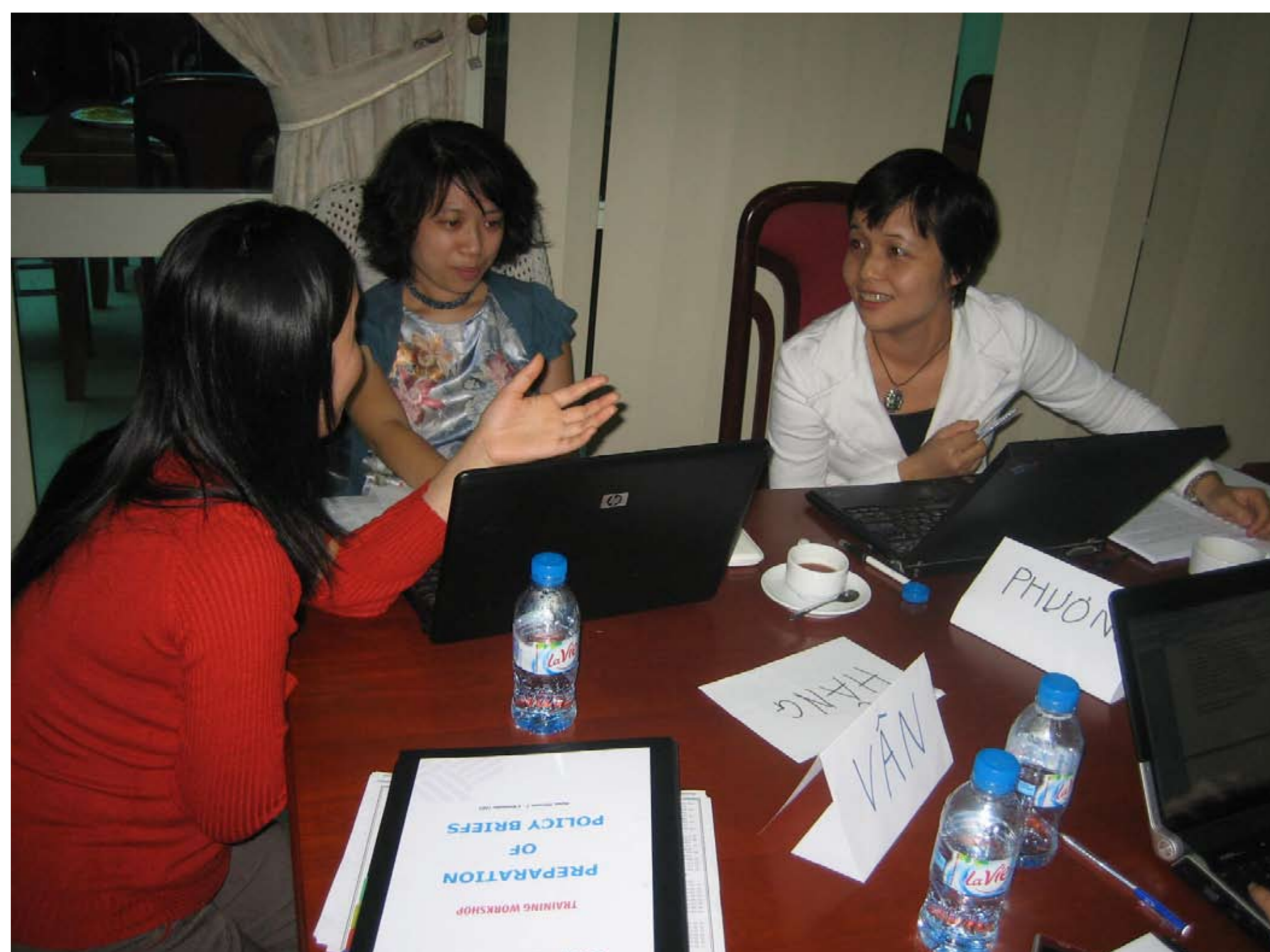
Training participants in Vietnam discuss each others' drafts

You can ask participants to bring materials with them, or they can develop them from scratch in a writeshop.