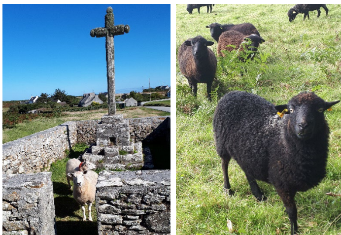
Left: On Ouessant, but not Ouessants. Right: Ouessants off Ouessant