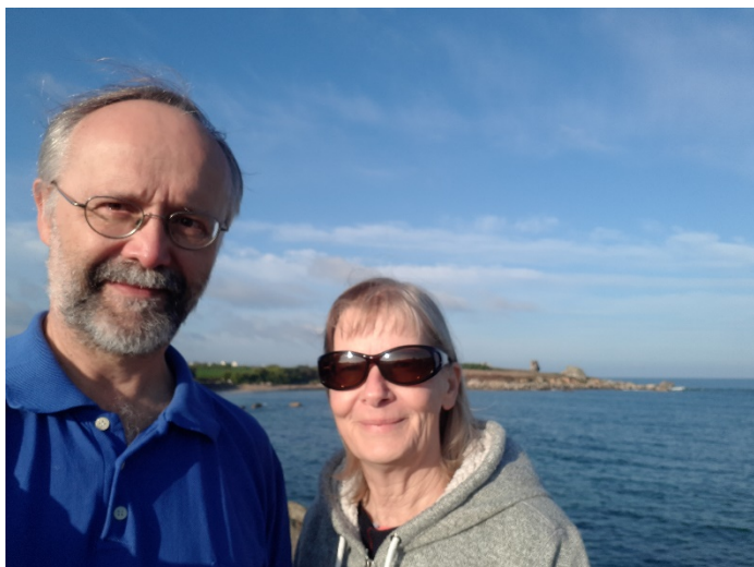
Brittany: like Cornwall but without the German film crews

Time for some research. Mr Google told us that the Ouessant breed had died out on the island, but had been preserved by aristocrats on the mainland who used them as lawnmowers around their chateaux.