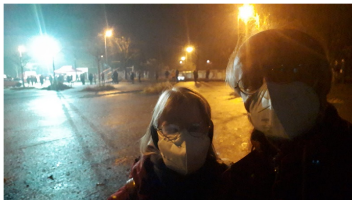
The end of a socially distanced queue

I counted 120 people in the line for our covid booster jab. One and a half hours of waiting was not too bad. If this were Indonesia or Kenya, there would be hawkers working the queue selling trinkets, snacks and magazines. This being Germany,