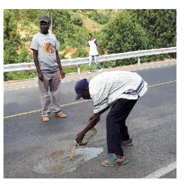
Which way is uphill?

KITULUNI HILLS, KENYA – A group of young men was waiting on the side of the road as our coach stopped. One poured water on the tarmac, and we gawped as it flowed uphill. This remarkable phenomenon has generated a minor tourist industry in the area, with young men demonstrating the demise of gravity by collecting water from a nearby stream and pouring it