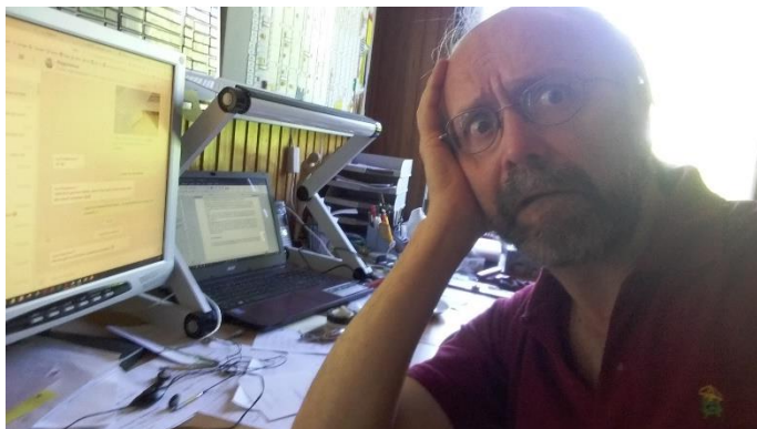
I wish to apologise for the lack of a picturesque view behind me

No matter: our friends taught me how to take selfies. Point the mobile phone in the right direction and tap the screen, and you get a beautiful picture of yourself staring resolutely away from the picturesque view behind you. All I need for a perfect shot is to look slightly less worried while I’m taking the shot.