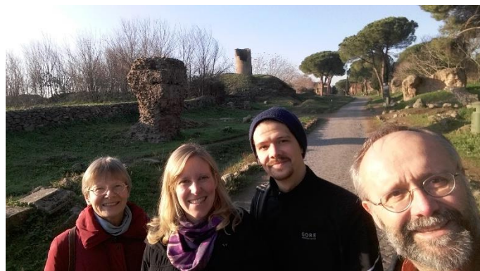
Via Appia Antica, Rome

ROME, ITALY – The perils of technology. I decided to try out the feature on my new smart watch that navigates you from A to B. Designed for sporty types who do not want to stare at a map on