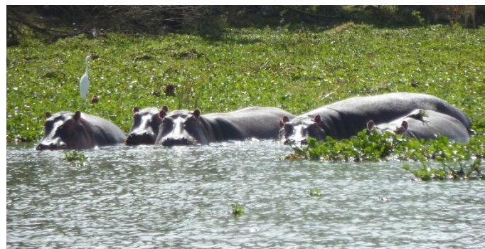
Close, but not friends

NAIVASHA, KENYA – Zebras are thought to recognize each other by their stripes – each one has a unique pattern. But how about hippos? They all look pretty similar to me. And to each other too: apparently they tell each other apart by smell. And the males spray each other with dung to establish hierarchies. No wonder they do not seem to form lasting friendships.