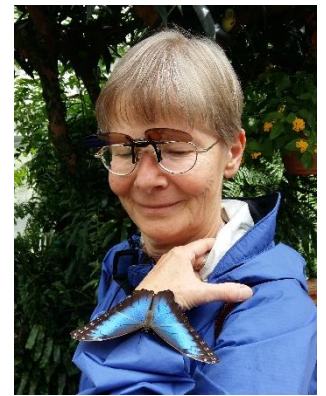
Butterfly house in Mainau: blue is the colour of Europe

WEIER, KÜRTEEN, GERMANY – If you want to sell bees, prepare new a colony by taking a honeycomb with bees and young larvae and putting it into a new hive. The bees will feed some of the larvae with royal jelly to turn them into queens. The first queen to emerge will hunt down all the other would-be queens and kill them: a hive can have only one queen. It’s a bit like the House of Tudor, or modern North Korea. Mark the queen on the back with a marker pen so you can spot her easily.