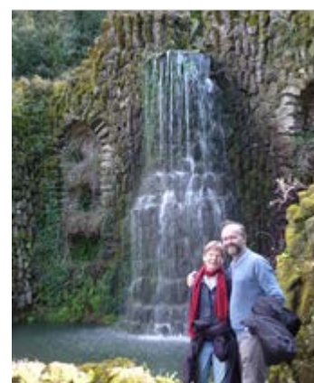
The riffraff invade Cardinal Aldobrandini’s private garden