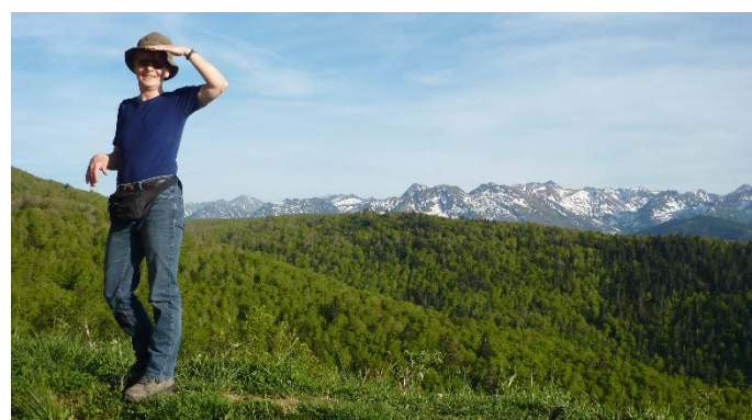
The Pyrenees are behind you...