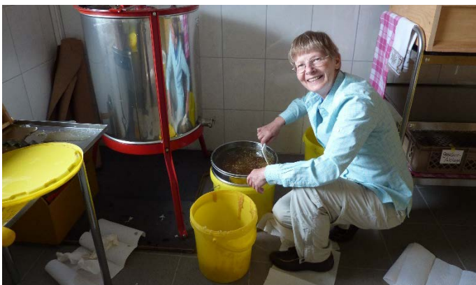
Centrifuging honey – we harvested 65 kg this year

One friend of ours has turned her hotel into a refugee home. Another has bought an old farmhouse in Bilstein, a village a few kilometres away, and has rented it to the council to house refugees. She plans to turn the barn into a cultural centre where people can learn German, play music and make art. They can