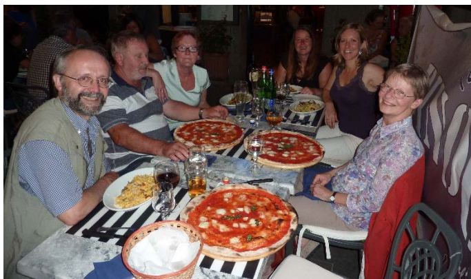
Another good reason not to move to Reading