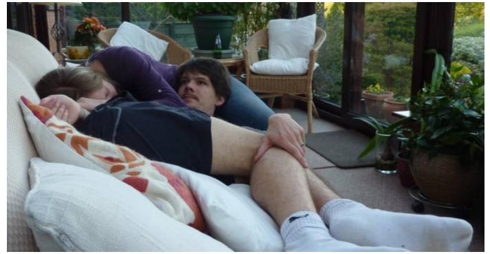
Look what a year of marriage does to you

DELHI, INDIA – The Green Park is aptly named: it is one of the few verdant areas in this dusty city. In the mornings and evenings, when the air is cool, it is full of walkers (like me), joggers, young couples and families. A sweaty young man does