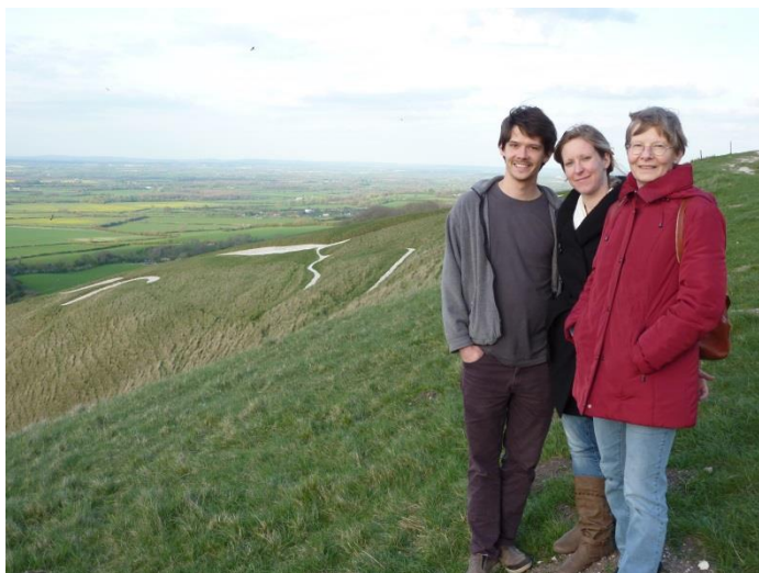
Windswept at the White Horse of Uffington