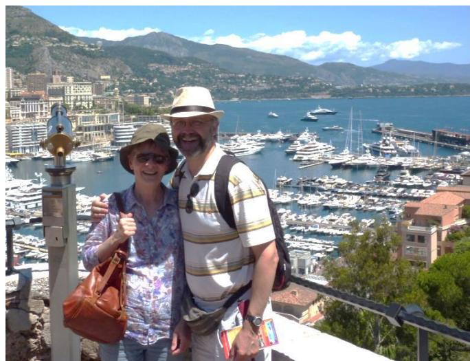
The yacht behind my left shoulder is ours